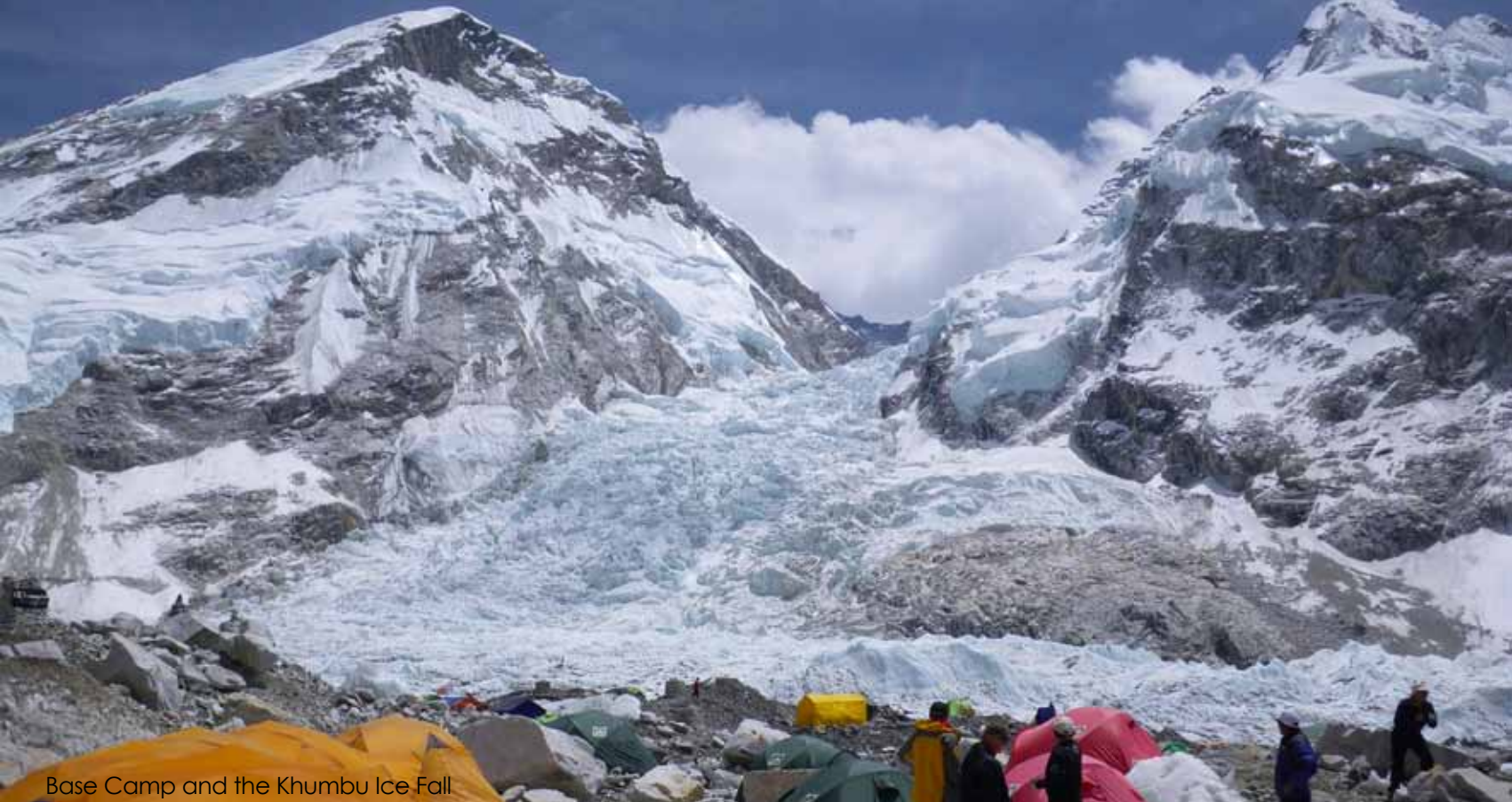
Base Camp and the Khumbu Ice Fall