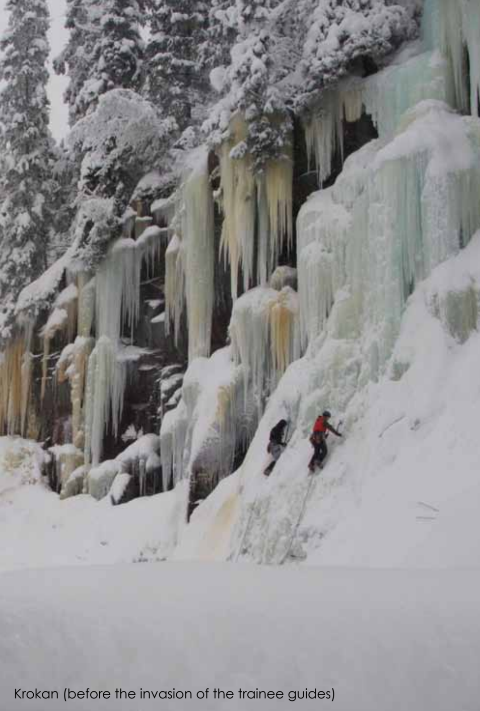
Krokan (before the invasion of the trainee guides)